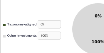
1. Taxonomy-alignment of investments including sovereign bonds*